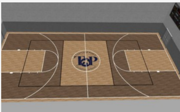
Rendering of the new floor