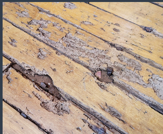
Worn and chipped floor boards