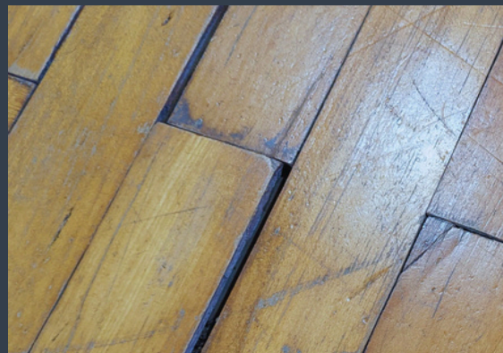
Loose and uneven floor boards